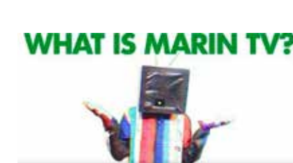
Marin TV: You're On the Air!