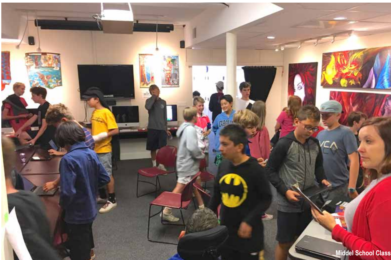
Middel School Class