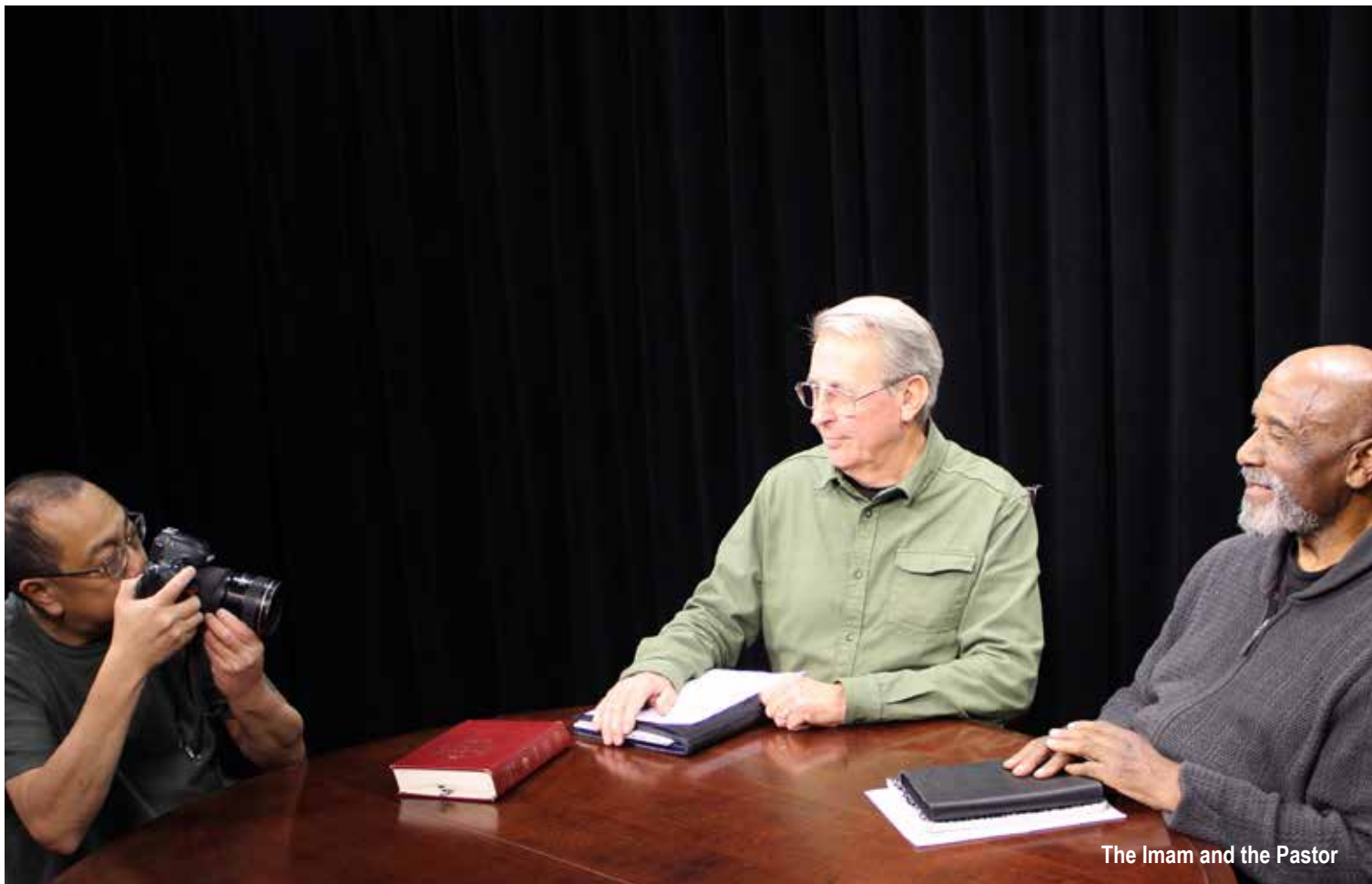
The Imam and the Pastor