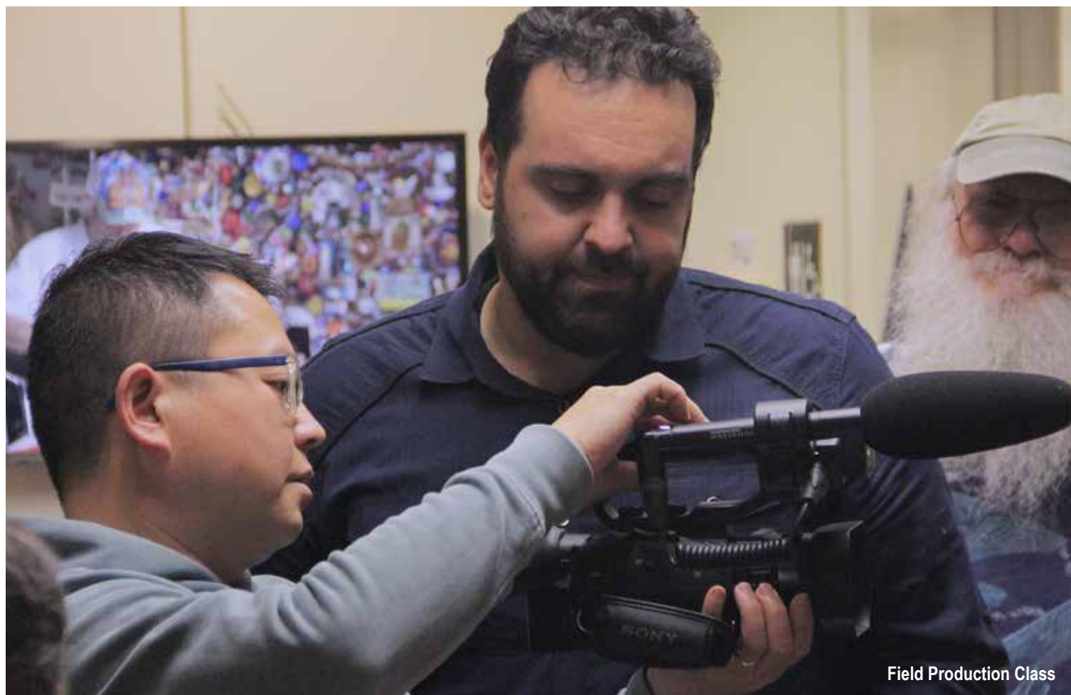
Field Production Class