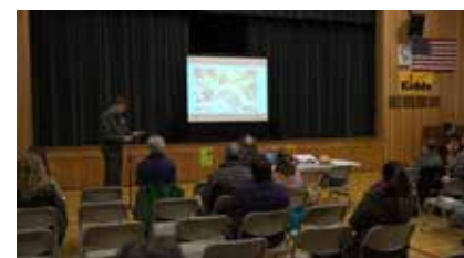
NPS: Muir Woods Update