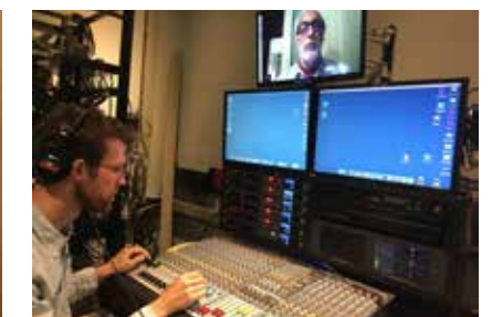
Crewing a KPFA Roundtable