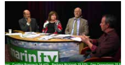
Marin Votes - Election 2018