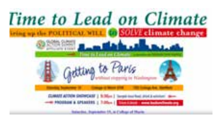
Time to Lead on Climate