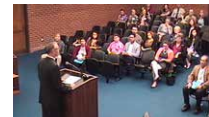
New Citizens Celebration