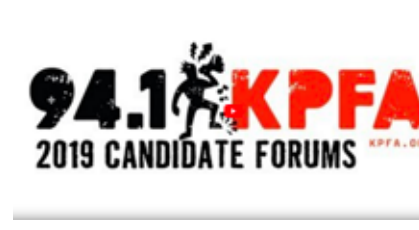
KPFA Candidate Forum 1