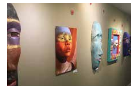
CMCM Art Exhibit