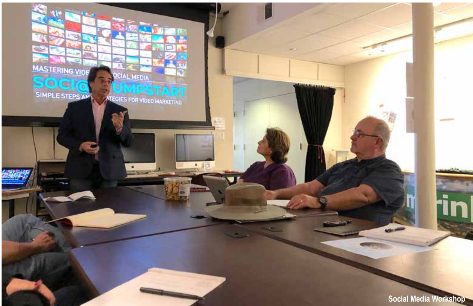
Social Media Workshop