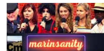
marINSANITY Episode 35