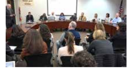
MCOE School Funding Forum