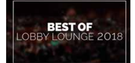
Best of IJ Lobby Lounge 2018