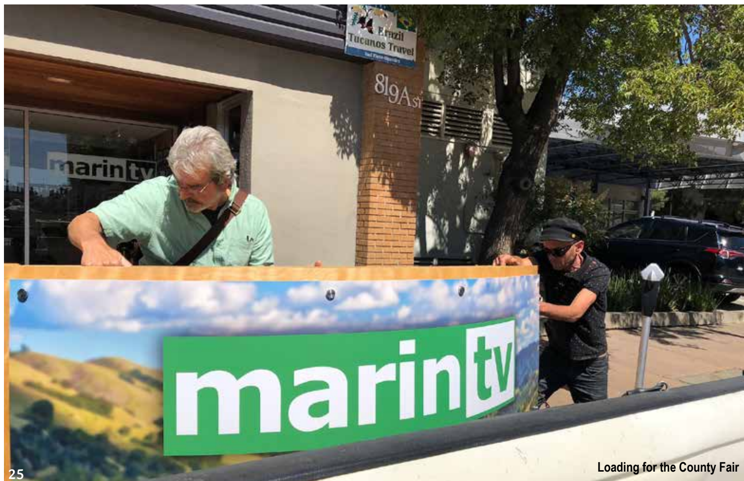
Loading for the County Fair