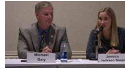
The Faces of Restorative Justice