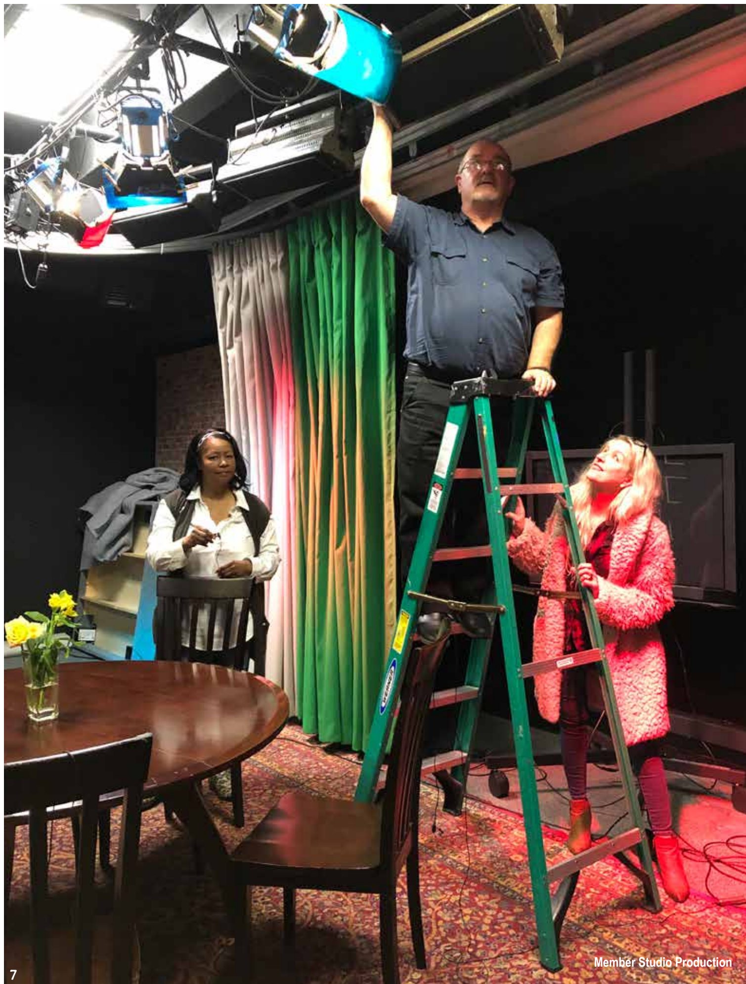
Member Studio Production