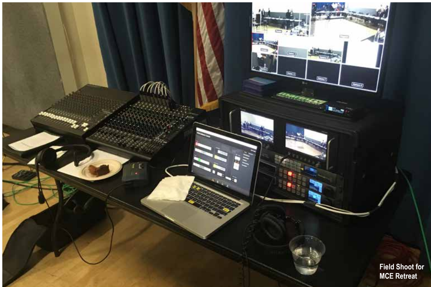
Field Shoot for MCE Retreat