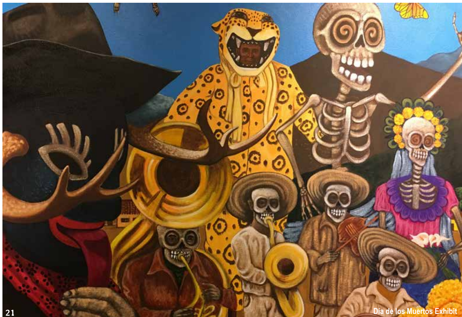
Día de los Muertos Exhibit