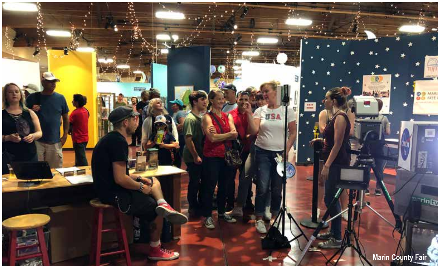
Marin County Fair