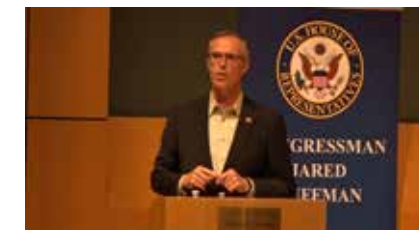
Jared Huffman Town Hall