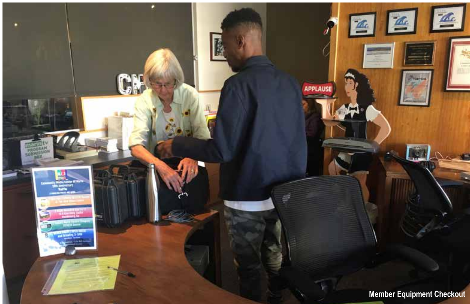
Member Equipment Checkout